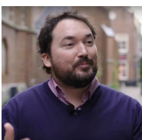
Peter de Laurentiis Stichting Cappella Pratensis Italy