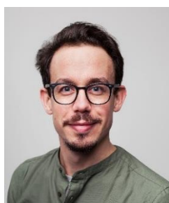
Morgan Little Crack Theatre Festival United Kingdom